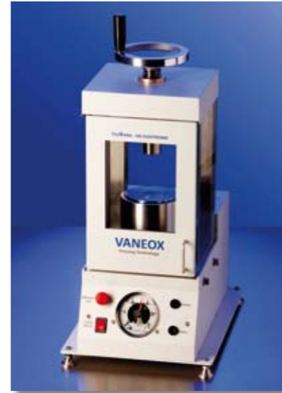
Vaneox - 25t automatic